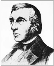
John Augustus "Father of Probation"